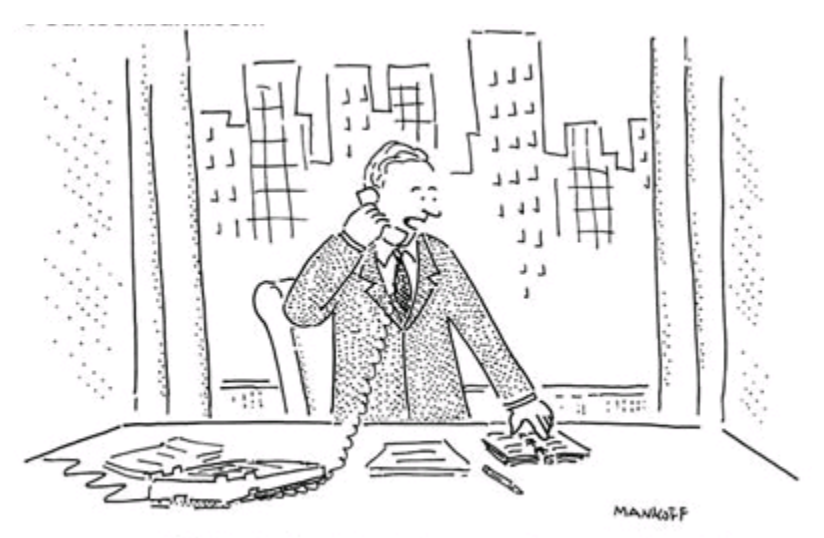
"No, Thursday's out. How about never-is never good for you?"

If you smiled then you probably had your own experience with the TASO (Total Attention Span Overload) syndrome, a condition afflicting most of decision makers at all corporate and government levels. TASO syndrome is primarily caused by: